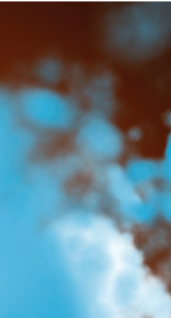
Ælab, Fukushima mes amours , 2011. 3D particle animation. Galerie B-312, Montreal. Animation excerpt: Gisèle Trudel.

video animation remediates the representation of radionuclides discharged into the atmosphere after the incident by drawing the lines of force of particle emanations in 3D software. 6 The ascent of particles shows the components of an ecosystem, which shift from one state to another to emerge transformed. In his doctrine on emotions, Whitehead proposes that subjects are sensible, self-constructed beings, essentially the sum of their prehensions or experiences of the sensible realm. 7 Prehension therefore plays a pivotal role in creativity, serving almost as a mnemonic repository of elements, a conception very much in keeping with Grupmuv's understanding of drawing as a process-oriented, integrative event, closely linked to movement and vision, as well as to duration and spatio-temporality. Going beyond cognitive limits and embracing the sensible, prehension provides a fertile ground for self-creativity, 8 one in which mnemonic content bridges the concepts of change (Whitehead) and actuality in a perpetual state of becoming (Bergson). 9 Grupmuv's process and manner of experimentation exceed the realm of the intelligible, intentionally and systematically